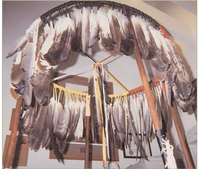
The 100 Eagle Feather Hoop at home in the White Bison office prepares to embark on Hoop Journey IV

During the entrance ceremony, the 100 Eagle Feather Hoop of the Nations will be carried in by members of your own community to begin the day. The Hoop carries the gifts of Healing, Hope, Unity and the Power to Forgive the Unforgivable. It has traveled Turtle Island so many times since 1995 to communities like yours that seek healing from substance abuse, domestic violence, and other struggles of Indian and non Indian people. The Hoop's Grand Entry marks the start of a day of miracles for the community.