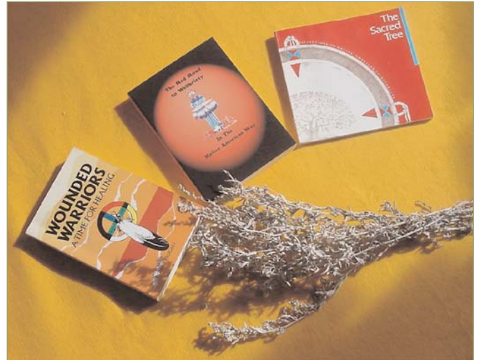
Three books used in the culture-based Freedom Way Program at the Stutzman Addictions Treatment Center in Buffalo, NY