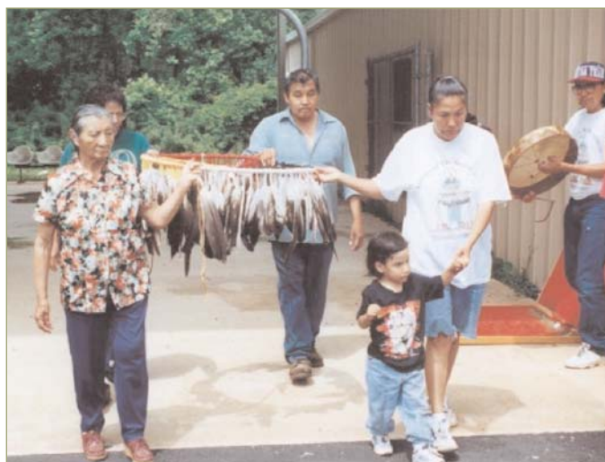
Community members carry the Hoop during a previous visit to Cherokee, NC, during Hoop Journey II in the summer of 2000