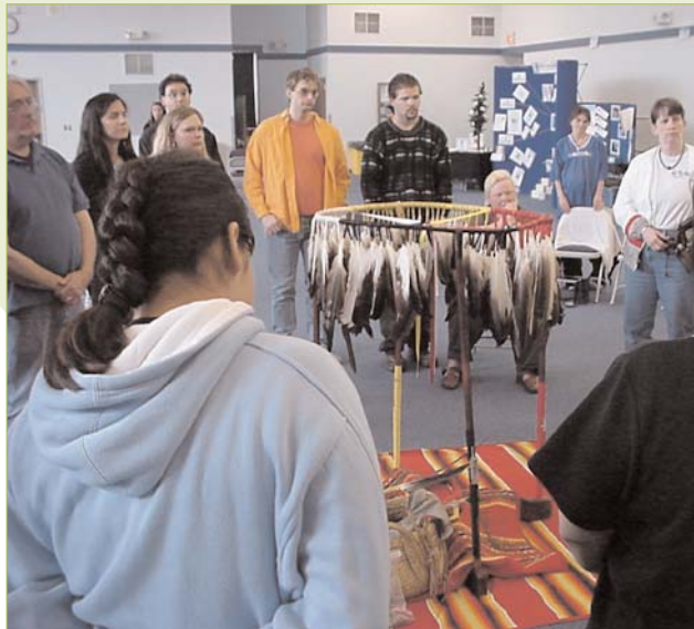
Preparing for the closing ceremony in Milwaukee. Each participant could offer tobacco and prayers at the Hoop.