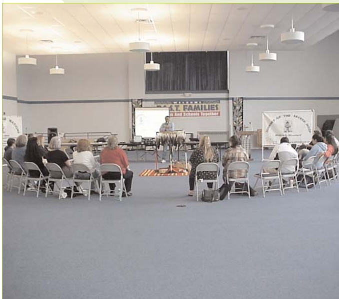
The Circle gathered to hear about White Bison, The Wellbriety Movement, and the Journeys of the Sacred Hoop.