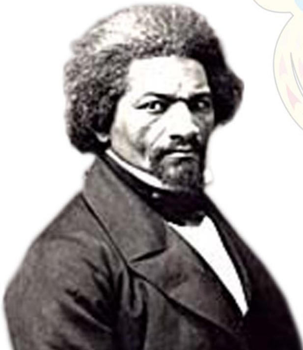
Frederick Douglass, 1818-1895