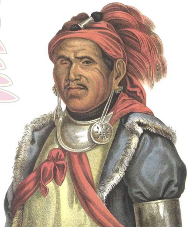
Tenskwatawa, Shawnee, 1775-1836

African-American Frederick Douglass, and Native American Tenskwatawa, were both passionate advocates of sobriety and cultural survival for their peoples in the 19th Century. In both African-American society and Native American societies there has been a proud history of resistance to the effects of drink by African Americans and Native Americans alike throughout the period of colonization and oppression in North America.