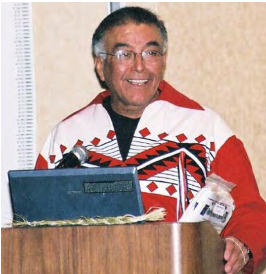
5_4 j Y Z I

CV R c \ d S j 5 4 j Y Z L 7 f U c R U A c V U e W H Y A V 3 Z I L T Z